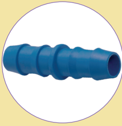
One Piece Connector

One piece connector to join different tubes