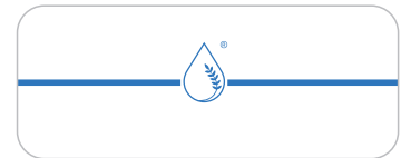
Single Line & Drop Marking for Sch 40