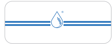
Double Line & Drop Marking for Sch 80